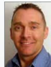
Paul Dillon Drug and Alcohol Research and Training Australia

There is a great deal of mythology around drugs and their use. This presentation will give accurate, up-to-date information on what we know about young people, alcohol and drugs in Australia. It will empower parents with basic information about current trends in alcohol and other drugs. It will help them to have meaningful conversations with their child and develop strategies to minimise the harms and risks associated with drugs and alcohol.