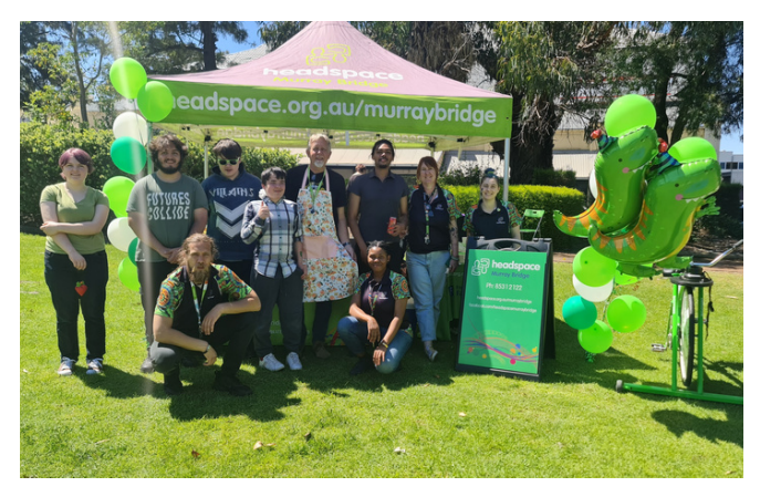
headspace Day was filled with good times, connecting and sharing with our Murray Bridge community.