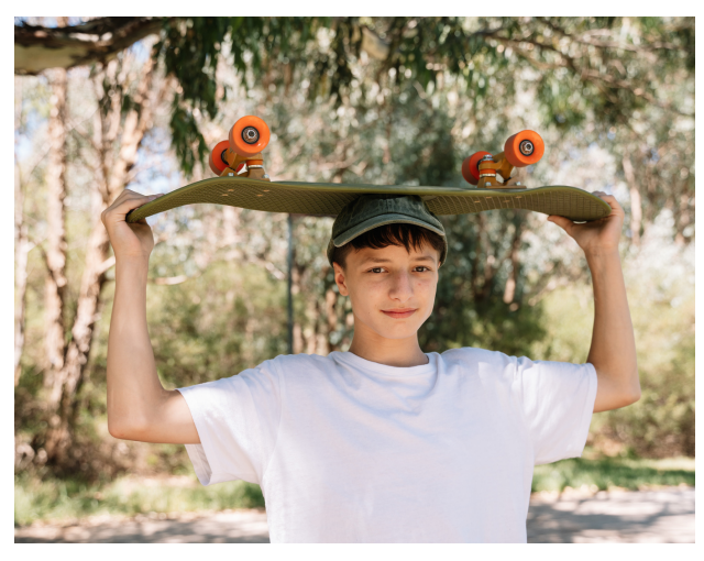
headspace Murray Bridge wishes you a merry and safe festive season.