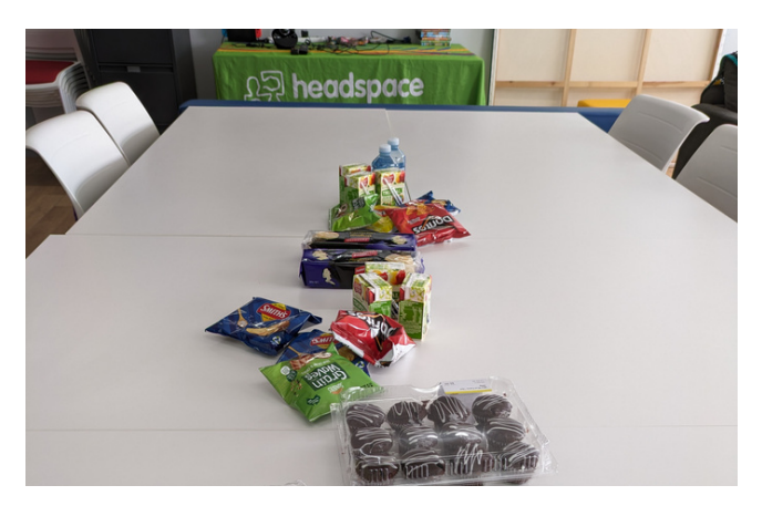
At Hangout we play games, cook, watch movies and spend time together in a youth friendly space.